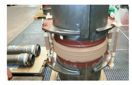
All stainless steel components and drill holes are masked for the multi-layer coating of the carbon steel parts