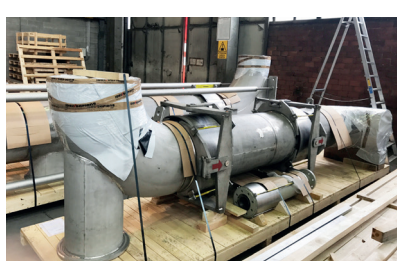
Group-wide production of expansion joints (Italy and Germany), central dispatch from Pforzheim